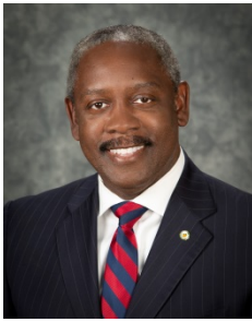
Orange County Mayor Jerry L. Demings